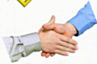
1st Masonic District