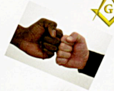
42nd Masonic District

There are lines separating our counties but as Masons there are no lines or boundaries that separate us. We are all Brothers. Enjoy an evening of fellowship from the patio of John Wright Restaurant looking East toward the Susquehanna river and a delicious meal followed by announcing raffle winners. All while be entertained with live jazz music.